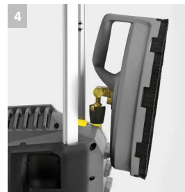
Shown with optional surface cleaner 2.111-016.0